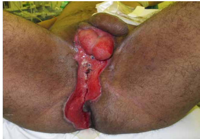
Figure 1. Postoperative period: 28 days of debridement.

To perform the SMFCTF, the patient was positioned in the lithotomy position, with abduction and partial flexion of the lower limbs under spinal block. Resection of fibrotic-scar tissue and excessive granulation was performed in the entire affected region - perineum, testes and funiculi (Figures 1 and 2). The open area was measured to facilitate flap demarcation. A transposition flap (90°) of the superomedial region of the thigh was used, with dissection in the fasciocutaneous plane and evidencing the gracilis muscle throughout the bed, without direct handling. The suture was made by flap planes in the midline and base of the penis, as well as in the thigh and perineum. The donor area was submitted to primary closure, by planes, in all cases. There was no need to use aspiration drainage (Figures 3 to 6).