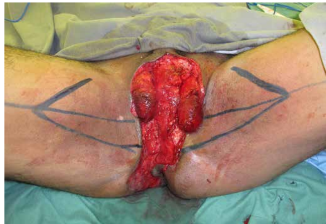
Figure 2. Bilateral demarcation of the flaps.