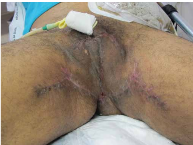
Figure 6. Thirty days postoperatively.