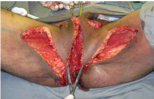
Figure 5. Medially transposed flaps.